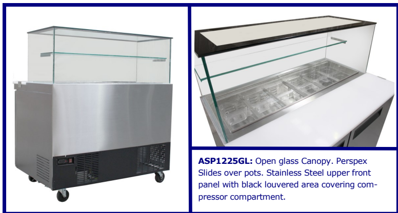
ASP1225GL: Open glass Canopy. Perspex Slides over pots. Stainless Steel upper front panel with black louvered area covering compressor compartment.