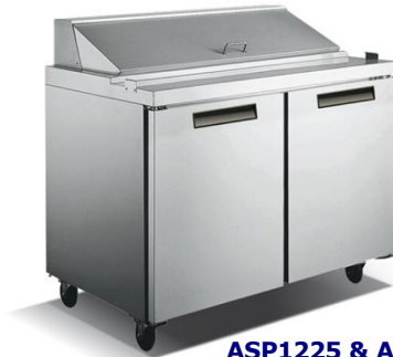
ASP1225 & ASP1555